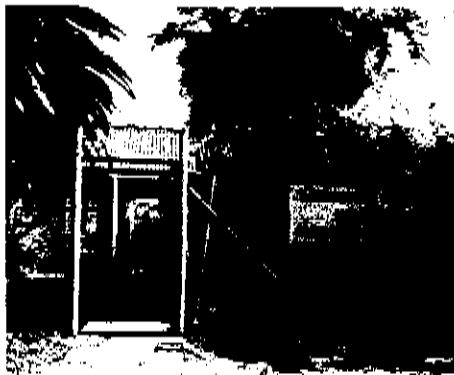
The entrance to the Magistrates' Court.

Warmbaths/Bela-Bela Magistrates' Office is therefore an office that tries to render the best service by applying the Batho Pele principle: People First.