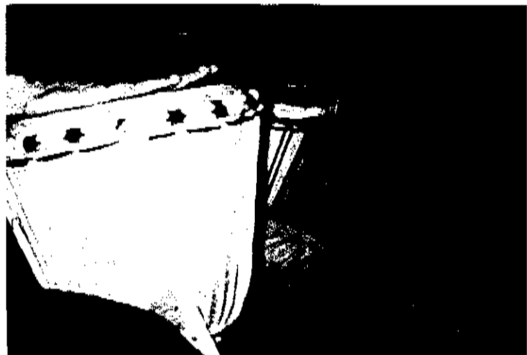
Children drumming, finding a rhythm.