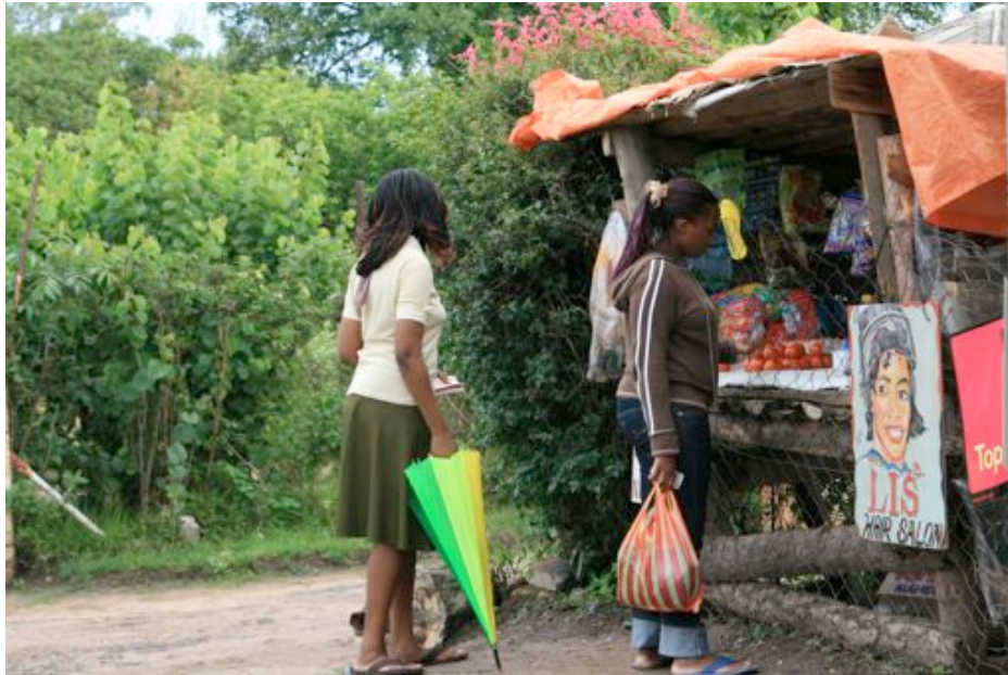
Figure 7: Young women at a small front yard store in Luanshya. December 2008.

some tomatoes, or visiting each others homes. Through this I realised that play for many women meandered along with the many other activities they engaged in.