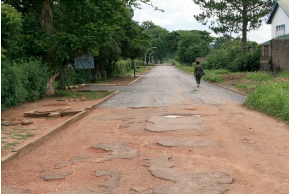
Figure 3: Pot-holed road partially filled in with flux stone sourced from the mine dumps (see Chapter 4 on economic activity at the mine dump sites).