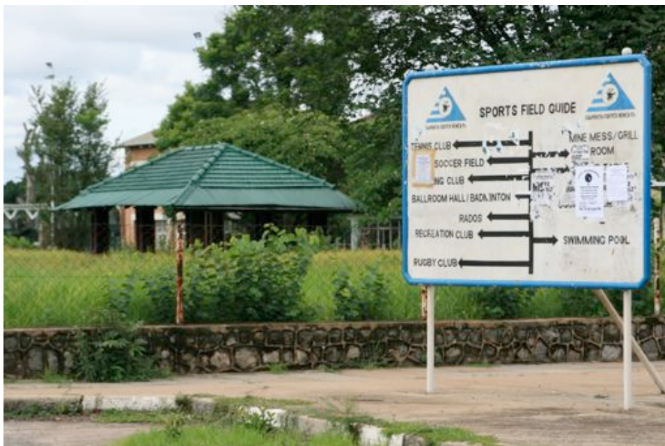
Figure 4: Luanshya mine recreation centre.