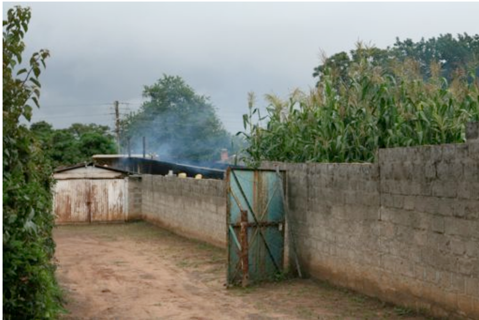
Figure 2: House front yard with maize stalks. In the background, smoking room for sausages made for sale. Photo by Mulemwa Mususa, December 2008

some resemblance to aspects of village life (as I describe later in the thesis), Copperbelt residents see themselves as modern. For this reason, they bemoan their towns that were “beginning to look like villages”, pointing not only to the towns’ changing physical appearance, but to forms of sociality and mutual support that were suppressed or discarded when mine administrations dealt with town infrastructure and welfare needs. As residents adopted new forms of livelihoods, material landscapes were being reconfigured, infusing social relations with altered needs and meanings reminiscent of village life.