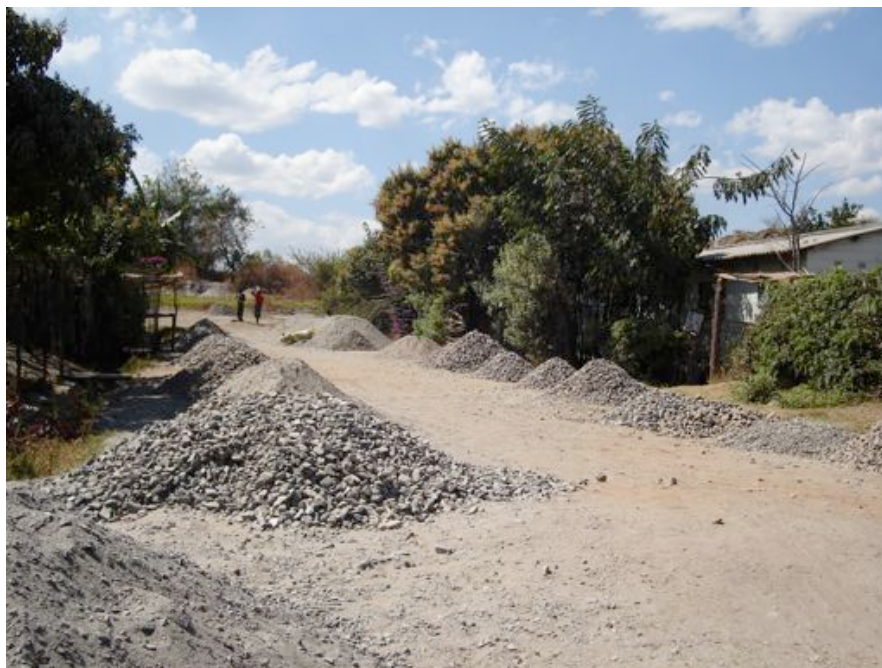
Figure 5: Street lined with heaps of flux stone from nearby mine dumpsite.

exploitative form of labor, where the employer gains much more than the employee. The newly rediscovered valuation of individual agency through self-employment constitutes an important break from the past. At the same time, it also shows a deep distrust of any form of economic development connected to the recent wave of foreign investment. This distrust also constitutes the foundations of the implied moral legitimization of illegality; illegal activity is regarded both as a necessity for survival and a morally justified act of redistribution. If, as they see it, foreign investors are here to “take everything”, then there is nothing wrong with taking some of these resources away from the investors. Informants often mention a Bemba proverb to make this point: ubomba mwi bala alya mwi bala (“one who works in a field, eats from the field”). Peter Walker and Pauline Peters’ (2001) work on land use in Malawi brings home similar arguments: when people illegally appropriate resources from private spaces they are not actually putting forward a claim over the ownership of these resources, but rather they are pointing out the unfair usage of the same resources by the legal owner.