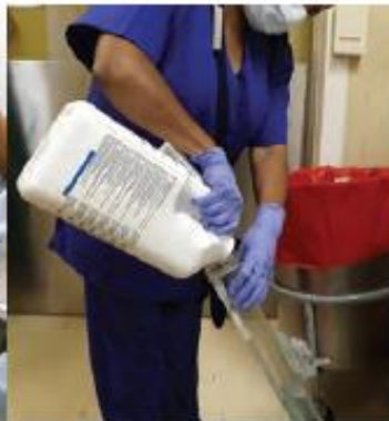
Figure 2b: Preparation of disinfectant solutions