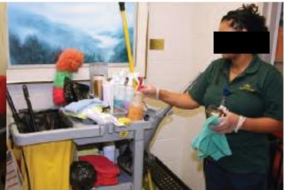
Figure 2c: Use of various surface cleaning agents

Natural-rubber latex is usually associated with Type-I immediate hypersensitivity reactions and is becoming less of a concern, as described earlier. The incidence of sensitisation to natural-rubber latex has decreased to 1% with the implementation of avoidance measures. 42 More recently, Type-I immediate hypersensitivity and Type-IV delayed hypersensitivity have been reported following exposure to disinfectants such as aldehydes (eg glutaraldehyde 43 and ortho-phthalaldehyde (OPA) 44 used to disinfect medical instruments) and chlorhexidine gluconate used in hand-hygiene products and dental solutions. 25,45 It is noted that hypersensitivity reactions upon exposure to these agents ranged from local to generalised skin reactions, respiratory or other systemic reactions and even anaphylaxis. 38,44,46 Owing to concerns about glutaraldehyde toxicity, OPA and combinations of hydrogen peroxide and peracetic acid were introduced as safer high-level disinfectant options. 47 However, when Anderson et al 48 compared the irritant and allergy potential of glutaraldehyde and OPA induced by topical application, they found that OPA had more skin irritancy and allergenicity than glutaraldehyde. The agents causing Type-I hypersensitivity skin conditions are generally both dermal and respiratory sensitisers. 43,44