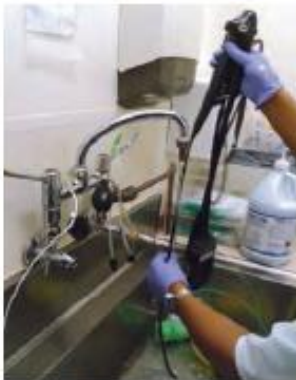
Figure 2a: Use of disinfectants for decontaminating medical instruments