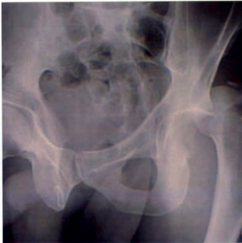
Fig.13 and Fig.14 In these two views you can see the advantage of seeing the uninterrupted posterior wall in the OOD which is obscured by the reduced femoral head in the OOR. Although the OOD view does not show the fragment well, it shows clearly the size, shape and location of the defect. The two views clearly augment each other