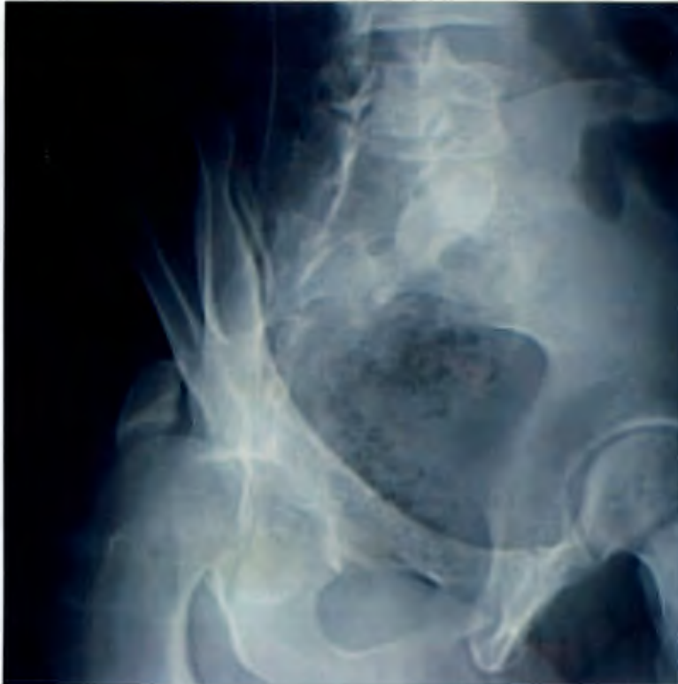
Fig. 10 The Serendipity OOD-view demonstrates the amount of initial displacement of the fragment. By seeing two views of the fragment we also have a better appreciation of its size and shape. The location of the defect in the posterior wall is well demonstrated in the dislocated view but obscured in the reduced view. The uninitiated might be inclined to treat this injury conservatively based on the reduced view but with an appreciation of how much the fragment has moved it becomes obvious that this intra-articular fracture could not be adequately reduced and surgery is essential.

See also the incomplete fracture of the remaining posterior wall lying anterior to the dislocated femoral head. These fragments will be "swept" into the acetabulum when hip is reduced closed. The true size of the defect is bigger than the apparently smaller superiorly displaced posterior wall which is viewed end on. (See also Figs 11 &12)