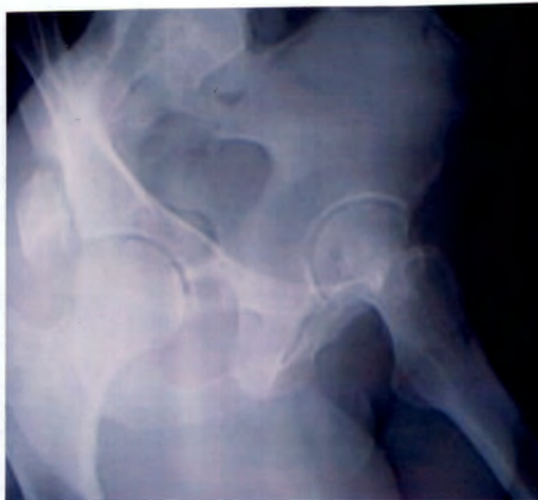
Fig.9 The Obturator-oblique view taken in the traditional fashion after reduction, demonstrates the fragment partially reduced. The posterior wall however is obscured from a clear view by the reduced femoral head. A basic principle of Orthopaedics is to see every fracture on at least two views. We take an AP and a Judet view but often the fragments are obscured by over lying bone. By having the OOD-view this gives a second clear view of the fragments which move with the reduction. (see Fig.10)