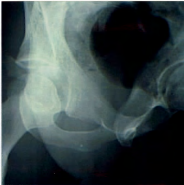
Fig.11 and Fig.12 This OOD-view demonstrates an undisplaced but fractured posterior wall. The post-reduction view demonstrates fragments within the joint. Based on the OOD-view a primary open reduction could have spared displacement of this fracture making anatomical "reconstruction" more accurate as well as protecting the scuffing of the articular cartilage which results from dragging these fragments across the articular surface.