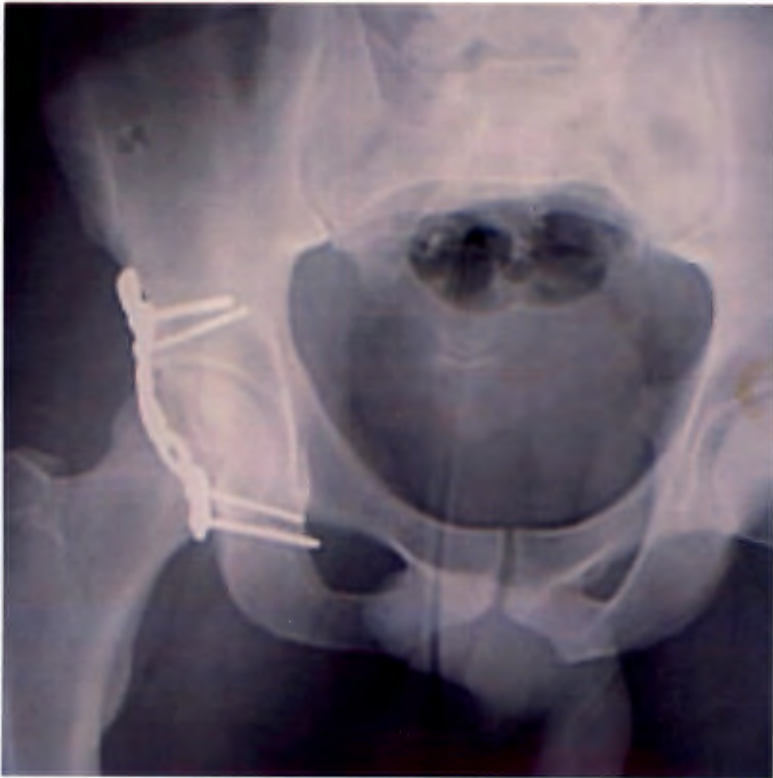
Fig.7 The patient presented with complete avascular necrosis of the femoral head at only six weeks. The fragment within the joint a remnant of the femoral head.