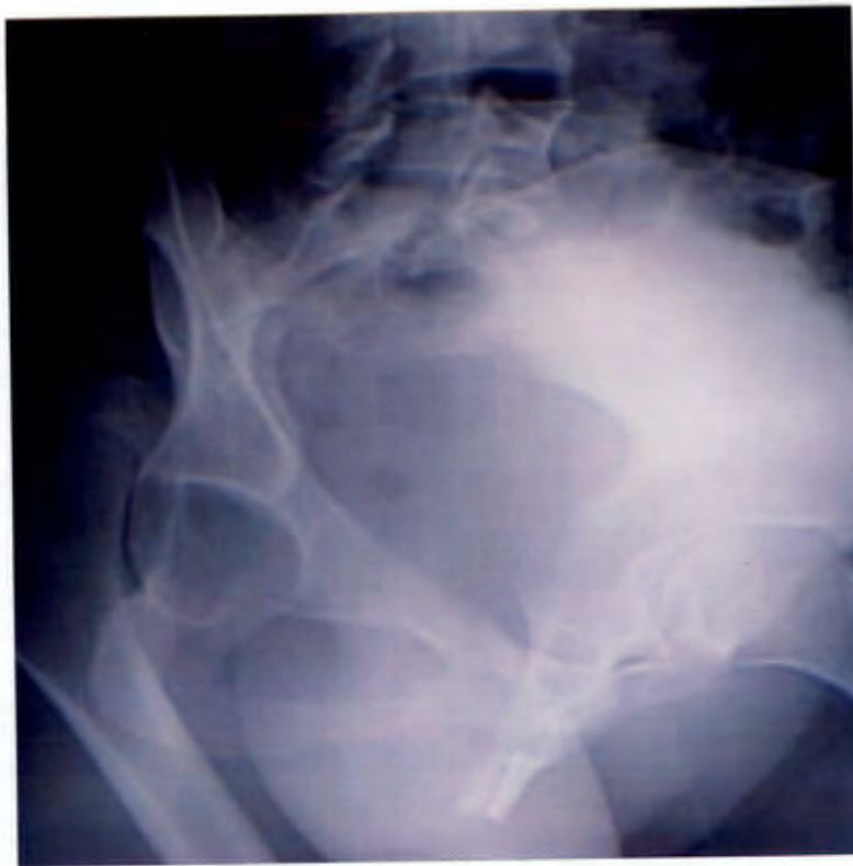
Fig.15 The majority of our cases are taken with the x-ray beam been tilted 45°. The view is somewhat distorted showing oval obturator foramen but demonstrates the uninterrupted view of the posterior wall. In Fig.16 the OOD-view with the patient tilted demonstrates the normal shaped obturator foramen. Unfortunately despite the effort of tilting the patient the quality of this particular radiograph is poor.