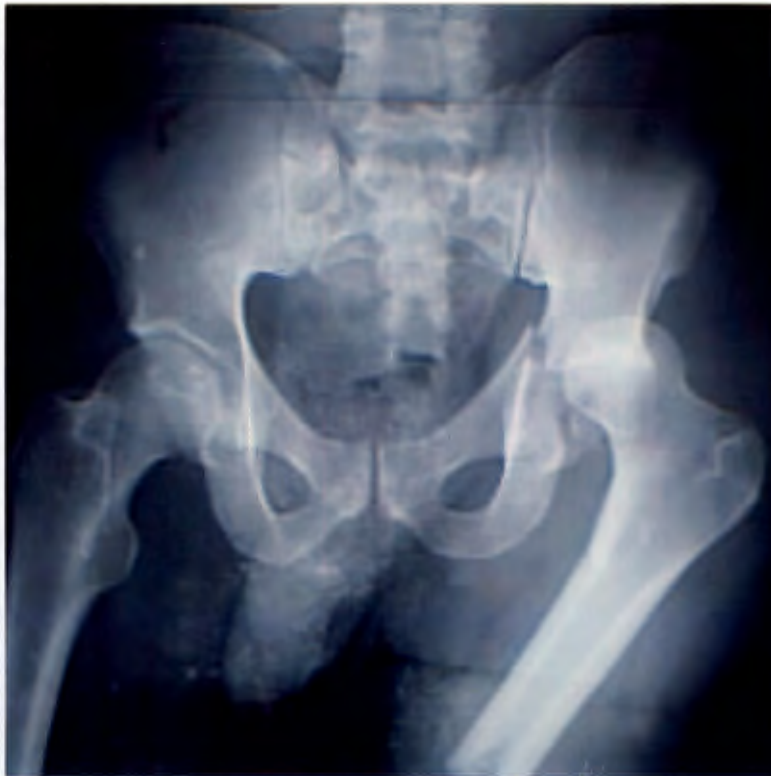
Fig. 1 and fig. 2. Two examples of an associated femoral shaft fracture. Note the transverse nature of the shaft fracture. The posterior dislocation of the hip displays the classic clinical appearance of the flexed, adducted and internally rotated hip. Internal rotation is recognised by invisible lesser trochanter.