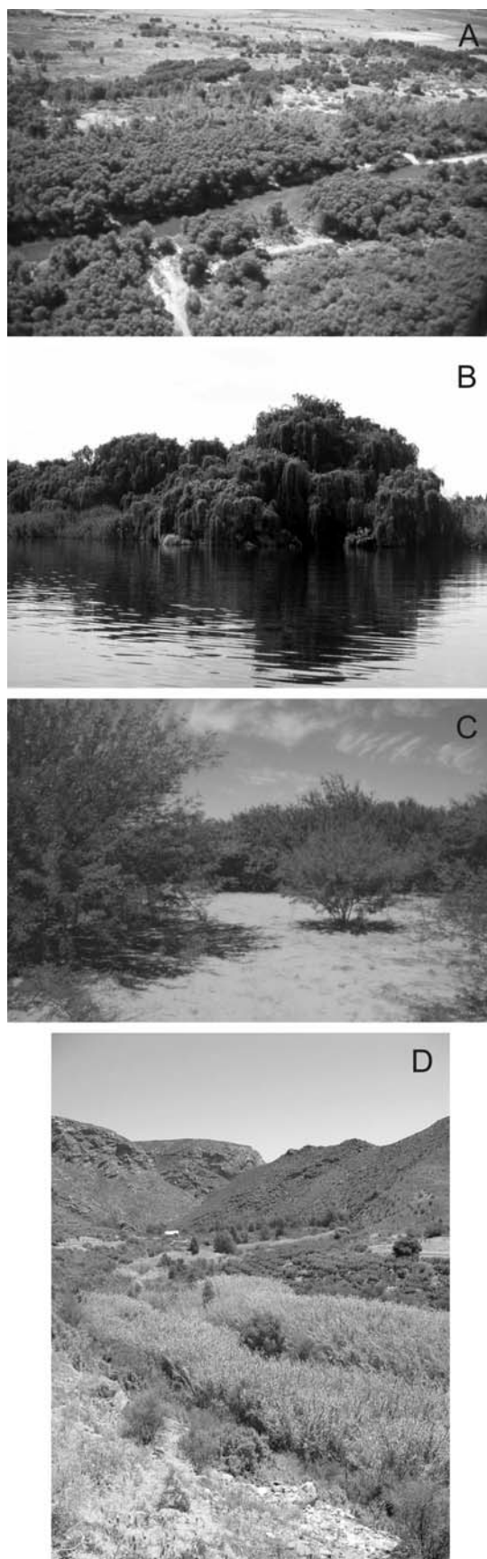
Fig. 3. Examples of alien plant invasions in riparian zones in South Africa: A , dense invasion by Acacia mearnsii along a foothill section of the Riviersonderend River in the winter to all-year rainfall area; B , Salix babylonica invasion along the Vaal River in the summer rainfall area; C , dense Prosopis species invasion along a watercourse in the arid interior; D , dense invasion by the alien reed Arundo donax along the Huis River in the arid interior.

Within the flood-prone width of the river, dense alien stands increase flow resistance, dampen turbulence and aid sediment deposition. 5,14 Changes to channel shape may then follow, with the type of change related to the particular geomorphological reach in which the invasion occurs. In some cases, usually in lowland rivers, channels deepen and banks steepen. 4 In less entrenched foothill rivers, alien trees have a damming effect on flow, leading to a widening of the watercourse and the conversion of well-defined rivers into diffuse systems of shallow channels. 5,14 Once the flood waters subside, these channels may be further colonized by alien plants. 109 Isolated alien trees or groups of trees in the channel form obstructions that increase flow vortices around them and may cause local scour of river banks during floods. 14 A risk associated with the development of higher depositional banks under aliens is that rooting depth is less likely to extend below the failure plane of the bank, resulting in more frequent bank slumping. 14,110 In headwater streams, invasion by alien trees may increase the amount of woody debris entering the stream, causing debris dams that potentially may lead to local channel widening. 14 This effect would likely have the highest impact on aquatic ecosystems when short riparian