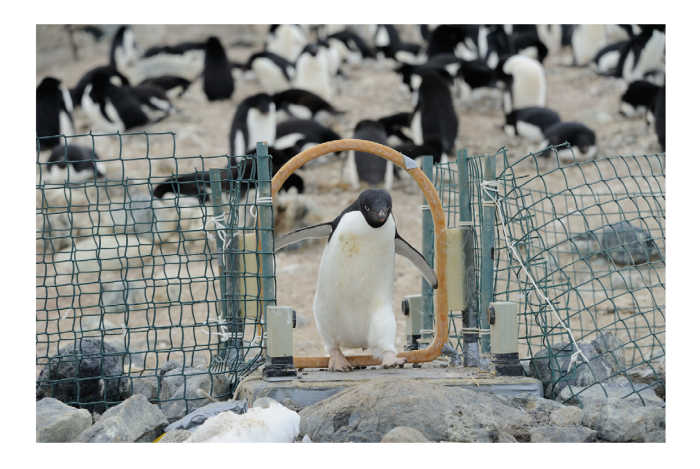
Figure 2. Adélie penguins are identified and weighed each time they cross the automated weighbridge on their way to/ from the sea. doi:10.1371/journal.pone.0085291.g002

that we obtained, these results will need to be confirmed by further studies.